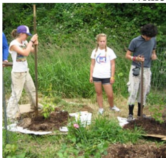
Tree planting along Alder Creek

Once again we are moving into winter in our cycle of seasons. Our activities slow down but never come to a halt for late fall and early spring are good times to do more restoration planting, using the trees and shrubs from our own nursery. We started many of these babies last January from cuttings taken here on Alder Creek Farm. We have fertilized and watered them all summer and now they're ready to go out to build habitat for many creatures on our properties. Winter is also our planning time, a time of writing grants and arranging workshops and educational programs to begin as we move into spring.