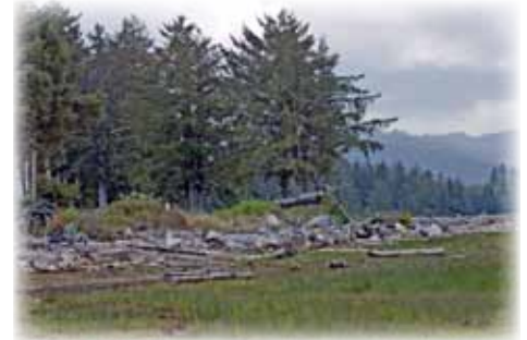
SITKA WETLANDS