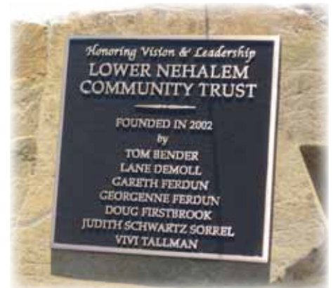
FOUNDER'S PLAQUE