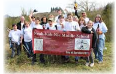
NKN MIDDLE SCHOOL COMMUNITY DAY OF SERVICE.

Nehalem Bay State Park Nehalem Grade School North Coast Land Conservancy North County Food Bank North County Recreation District Oregon Community Foundation Oregon Department of Fish & Wildlife Oregon Parks Foundation Oregon Watershed Enhancement Board Rotary Club of North Tillamook County The Nature Conservancy Tillamook County Cultural Coalition Tillamook County Master Gardeners Tillamook Estuaries Partnership Upper Nehalem Watershed Council U.S. Bureau of Land Management