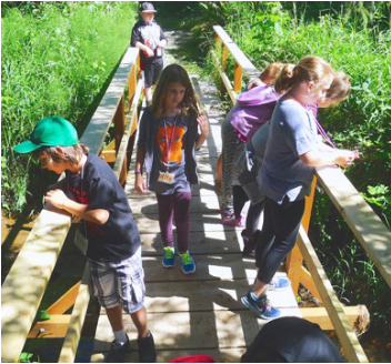
Forest-to-Sea Science Campers taking it all in from the bridge at Alder Creek Farm