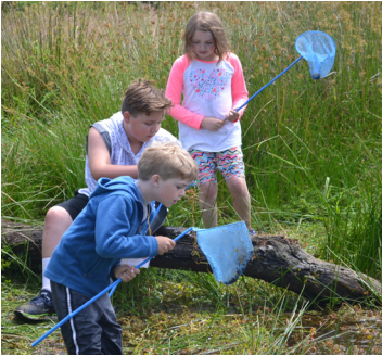
LNCT lands are an outdoor classroom to over 300 local area students