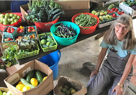
882 lbs of produce harvested at ACF benefit the North Coast Food Pantry and Nehalem Senior Meals Program