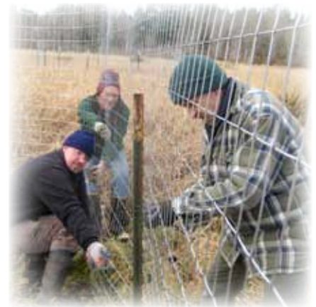
ABOVE: NORTH EDGE PROPERTIES STEWARDSHIP. BELOW: OLD-TIME MUSIC AT THE HARVEST FESTIVAL