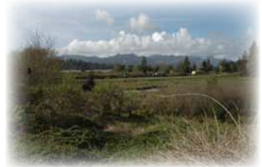
ZIMMERMAN MARSH