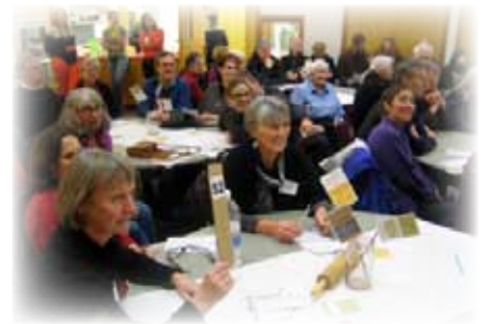
PIE DAY BIDDERS.