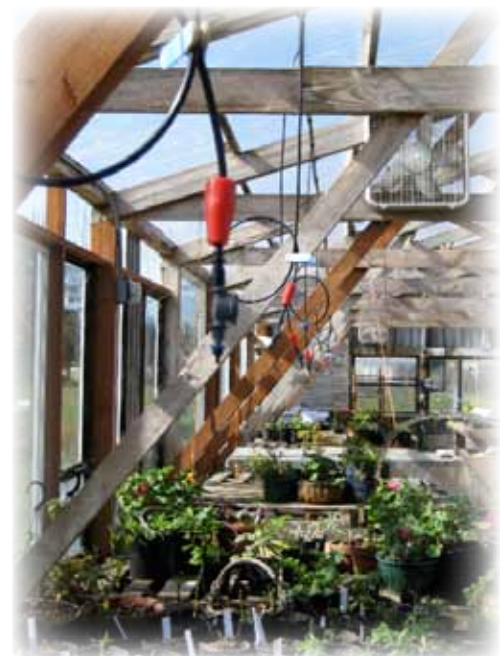
ALDER CREEK FARM GREENHOUSE UPGRADES.