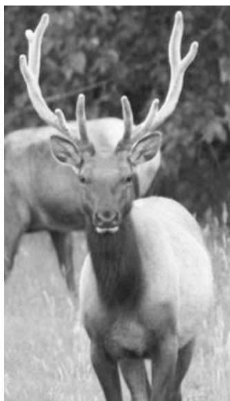
Roosevelt elk at Elk Meadows