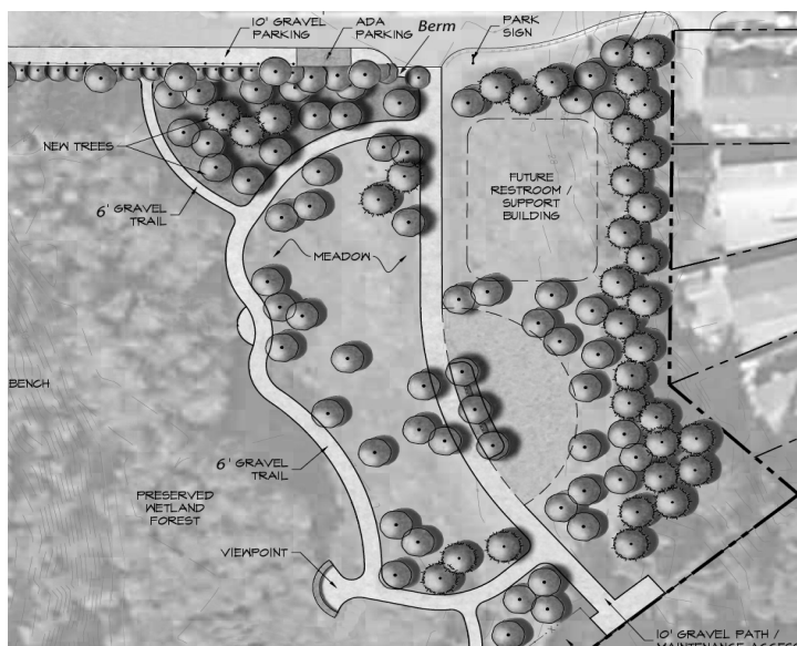
Map of Elk Meadows Phase One J.D. Walsh & Associates, P.S. - Landscape Architects